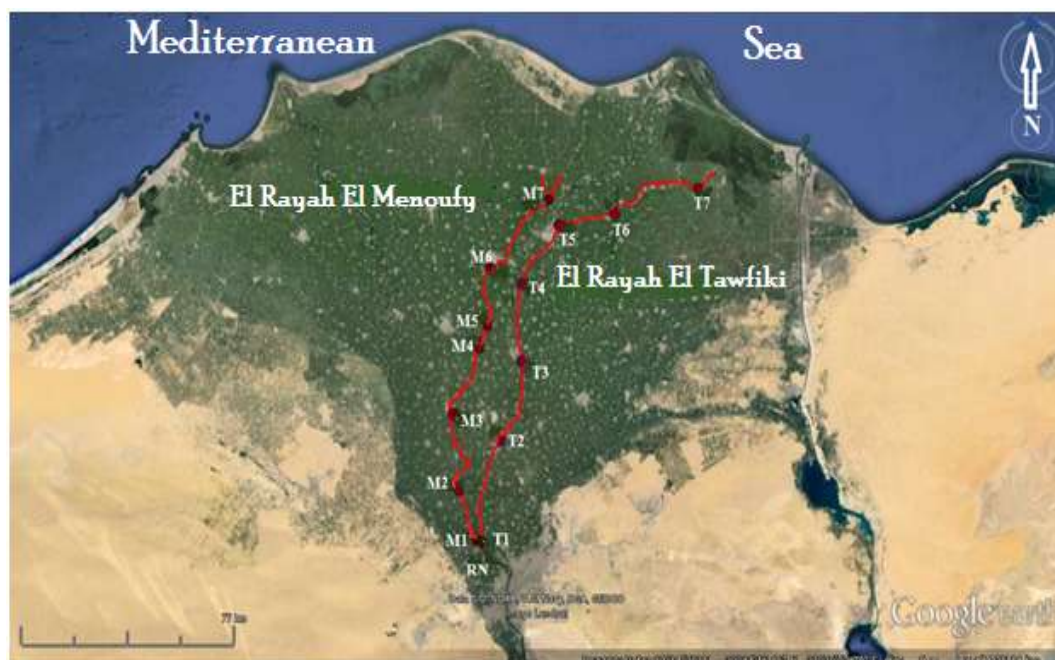
Fig. (1). Map of the study area showing the sampling locations.

Water samples were collected from one site of River Nile (RN) and 7 selected sites from each El Rayah El Tawfiki and El Rayah El Menoufy from spring 2014 to winter 2015 (Fig.1).