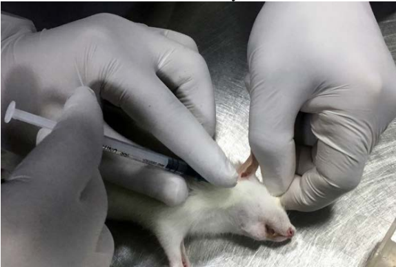
Figure (1): showing the intra-articular injection of CFA in the TMJ.

Induction of arthritis was carried out in the left TMJs of all animals by a single intra-articular injection of 50 \mu l (12) of Complete Freund's Adjuvant (CFA), diluted 1:1(oil: saline) (13) (14) (Fig.1) CFA used was of a concentration of 1mg/ml heat killed mycobacterium tuberculosis. The day of the induction was considered 0 day.