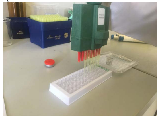
Figure (3): showing fixed volume Finn pipette used during the ELISA procedure.