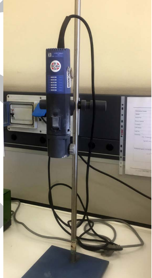
Figure (2): showing the tissue homogenizer machine used to grind the samples.

Tissue samples were obtained from both study I and II. First on day 7 before the first HMWHA injection, 7 animals were sacrificed. Secondly on the day 28, 7 other animals were sacrificed as well. Tissue extracts were rinsed with Phosphate buffer solution (PBS) to remove excess blood and then samples were cut into 1-2 mm pieces in size. Samples were grinded using a tissue homogenizer machine. (Fig.2) Tissue extract was centrifuged for 20 minutes at speed 2000-3000 rpm. Finally, the supernatant is extracted to be used. (18) The kit used was a double-antibody sandwich enzyme-linked immunosorbent assay (ELISA) and MMP-3 levels were measured according to manufacturer's instructions. (Fig. 2 and 3)