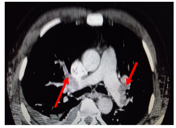
Figure (2): Bilateral pulmonary embolism (arrows) in male patient 38 years old with traumatic fracture pelvic presenting by shortness of breath.