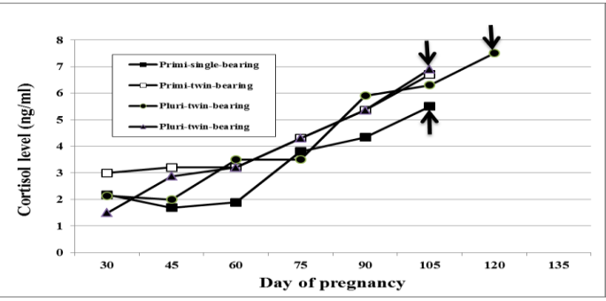
Arrows indicate days of abortion.

Fig 3: Serum cortisol level (mean \pm SE) in solitary cases of abortion in ewes.