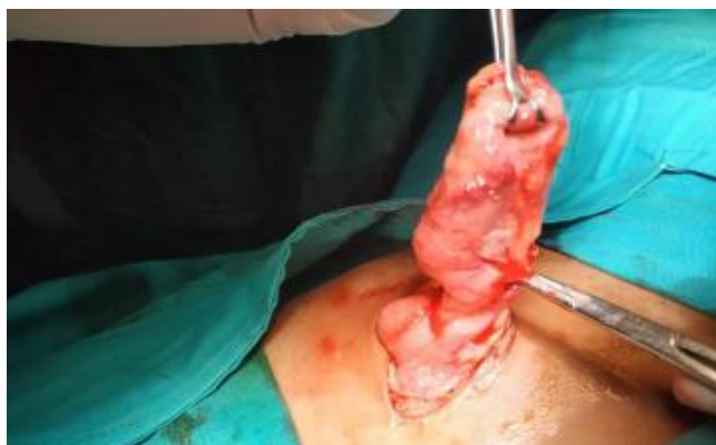
Fig. (6): Conventional open appendectomy.

The mesoappendix was divided between clamps and ligated with an absorbable suture. The base of the appendix was divided and ligated with absorbable suture material. Purse string sutures were done in cases of inflamed base of the appendix.