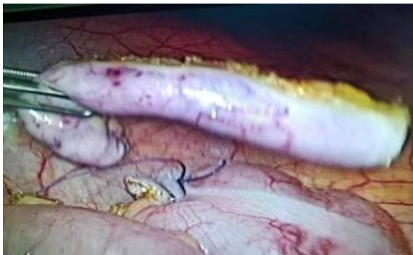
Fig. (4): Laparoscopic appendectomy.