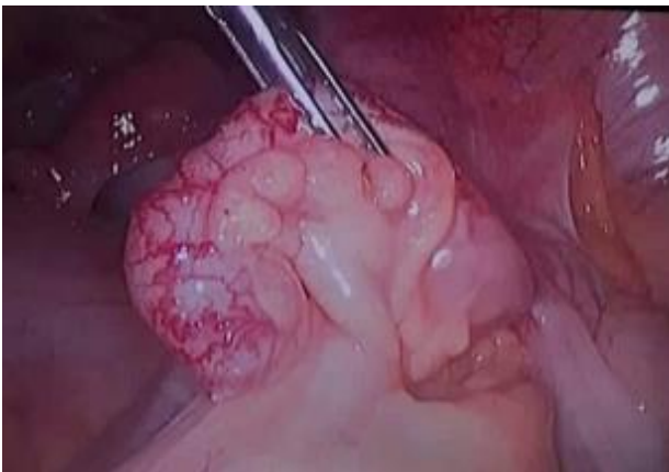
Fig. (1): Identification and grasp the appendix using grasper

Two more trocars were inserted, one in the left iliac fossa (5 mm), and the other in the right upper quadrant (5 mm). This was done lateral to the inferior epigastric vessels.