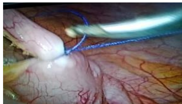
Fig. (2): Laparoscopic appendectomy using ligature

Once vascular control has been achieved, any connective or adipose tissue surrounding the appendix should be cleared, leaving the appendix attached only to the base of the cecum. Amputation and removal of the appendix dividing the appendix using vicryl 2/0 sutures to amputate the appendix, endoloops consisting of a heavy absorbable suture may be used. Two sutures are placed proximally and a third one is placed about 1 cm distally. The loops should be cinched firmly around the appendix, without tearing through it ( Fig. 2 ).