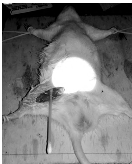
Fig. (1): The surgical incision.

color then the area of these binaries is measured by the Lecia Qwin @500 software. This is done for every field of the five fields for each subject to obtain a mean area for each. Mean area percent is the relation between the areas of positivity marked by the binary images to the field area which is 7286.783 \mu\text{m}^2 . Results obtained were subjected for statistical analysis.