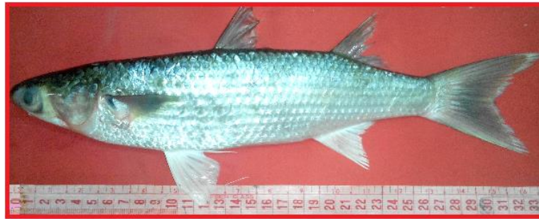
Fig. (2): Lateral view of golden grey mullet, Mugil cephalus , collected from Abu-Qir Bay.

The species ( M. cephalus ) were selected carefully to cover two sized groups. One of these was a small-sized group (21.00-29.90 Cm), while, the large-sized group (30.00-43.5.00 Cm). After dissection, a known weight of the target organs (kidney, liver and muscles) was kept under the freezing condition at 4°C until the latter examinations.