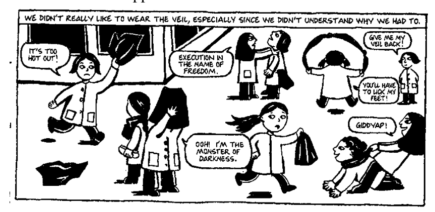
Fig. 2: Satrapi, Persepolis 3.

In delving deep into the incidents of the graphic memoir, Satrapi's text-images play a pivotal role in epitomizing the intertwined connection between "power" and "resistance." This is strongly traced in the way Satrapi utilizes physical objects which have become compulsory in everyday life to disclose the "disciplinary power" exercised over women's "bodies" in the newly constructed Iran and their fluctuation between two contradictory cultures: the old modern Iran and the re-constructed traditional one. In a wide-frame panel, Satrapi draws young school girls resisting the "power" imposed on them by taking off the headscarves, playing with them as skipping ropes, hide and seek, and making them as collars. All these are different forms of civil opposition.