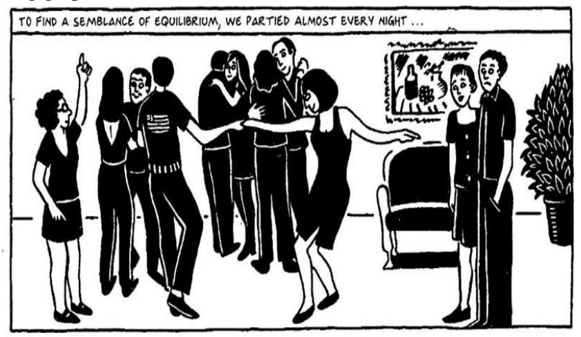
Fig. 5: Satrapi, Persepolis 2 152.

"veiling" (148) putting on makeup and wearing colored socks as a subtle strategy of countering the despotic regime. She, also, vividly portrays how she and her friends make parties every night which are not only restricted to women but also encompass men. As pointed out by Milani, "[g]ender apartheid, . . ., is more than a religious ordinance. It is related to such mundane matters as power, domination, and exclusion. If not sanctified in the name of religion, then it has relied on . . .chastity, safety, beauty. . .to restrict women's mobility" (Words, Not Swords 3). As a means of challenging prescriptions dictated by the regime, both sexes in these parties break all compulsory measures and enforced disciplines regarding dressing, inherited traditions, behavioral patterns and gender-segregation policies mightily settled by the dictatorial regime; they convert the controlled, docile "bodies" into action both visually and verbally as exemplified in the following graph: