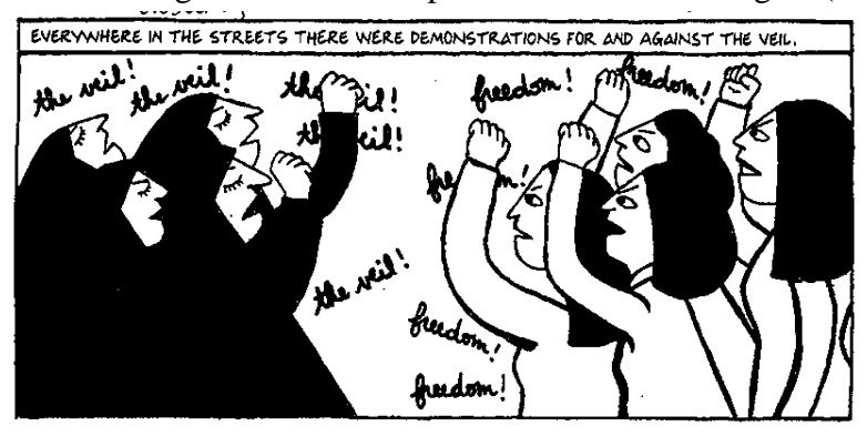
Fig. 3: Satrapi, Persepolis 5.

In one of the most critically addressed graphic images, Satrapi juxtaposes a complicated graph which deeply highlights the entangled relationship between "power" and "resistance." Satrapi draws women from diverse political and cultural backgrounds: on the left-hand side, the reader sees conservative women who wear black chador and have closed eyes call for "veil" and on the right-hand side, others with white clothing and open eyes scream for "freedom" refusing curtailment of their rights and all forms of oppression dictated over them by the new regime. As argued by Omar Kutbi, the "closed" eyes and the black dressing of the women suggest that they are "close minded" having fake consciousness and blind vision; and that is why they are incapable of predicating the dull destiny and miserable status they are driving their nation into, whereas others with "open eyes" and white dressing stand for their openness and future insights (125).