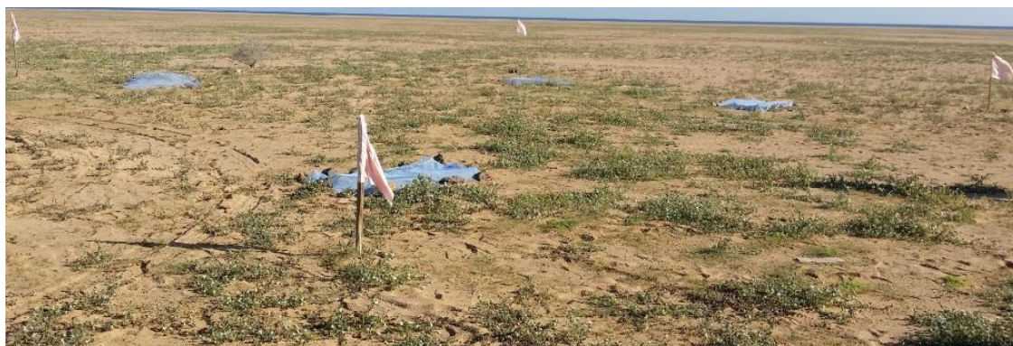
Figure 4. One of the plots at the site of treatment demarcated by flags