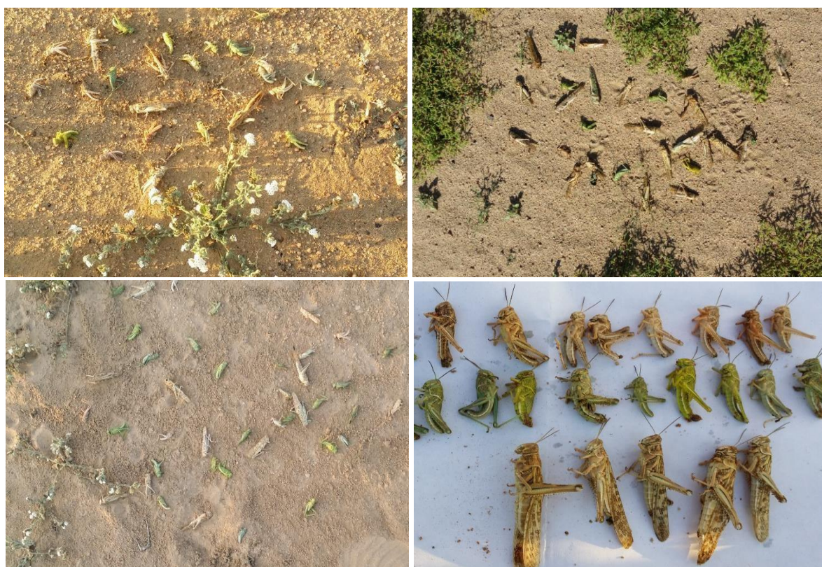
Figure 5. Images showing the dead adults and hopper in various instars after the field test