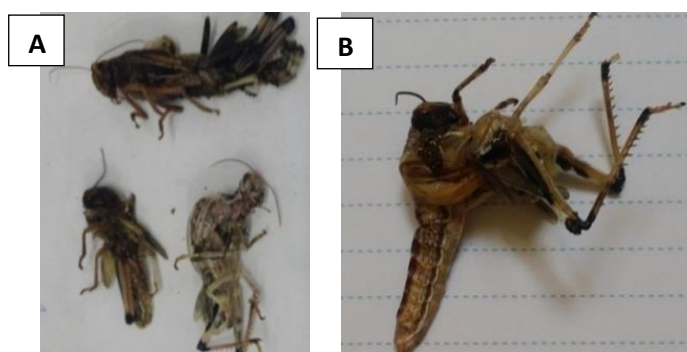
Figure 3. Malformed hoppers (a) and failure of moulting (b) caused by sub-lethal concentrations of spinosad ( LC_{30} ) in S. gregaria

compounds, could reduce the populations of rangeland grasshoppers.