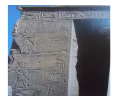
Pl. (16) Augustus with the sistrum before Isis, the left ante of the façade of Hathor temple at Phila; Ibid, fig.116.