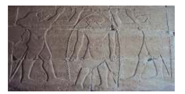
Pl.(14) Augustus is purifying by Horus and Thot- The middle scene of the lower register of the northern wall of the sacrifice room, Kalabscha temple, Ibid, fig. 173