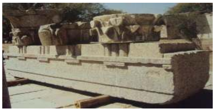
Pl.(1) Granite architrave next the Augustus's temple at Phila