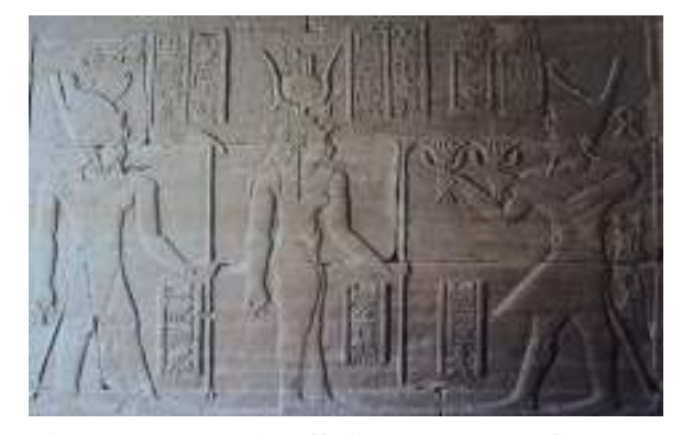
Pl.(13) Augustus is offering two Lotus flowers before Isis and Harpocrates- Kalabscha Hölbl, G., Altägypten im Römischen Reich, Der römische Pharao und Seine Tempel (II), Die Tempel des römischen Nubien, Mainz am Rhein, 2004, fig.185