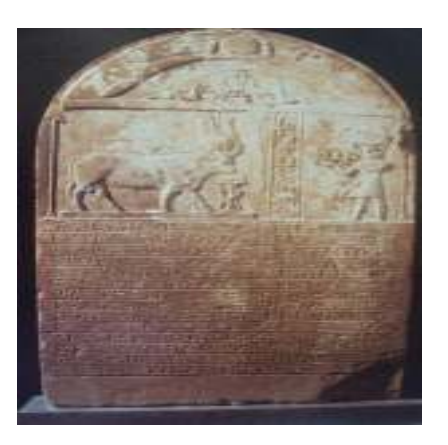
Pl. (8) Auletes before the Buchis bull Hölbl, G., Op. Cit, pl.9

Pl.(6) Auletes before Isis of Chemmis Bernand, E., Recueil des Inscriptions Grecques du Fayoum, Vol (I), Leiden, pl.9