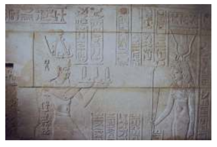
Pl. (11) Augustus is offering the Shyt before Isis- Kalabscha Ibid, fig.13.