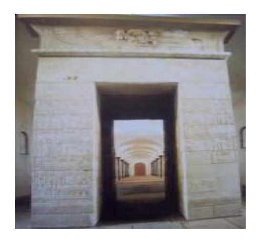
Pl. (10) The Kalabscha main gateway- the Egyptian Museum at Berlin; Hölbl, G., Op. Cit, fig.12