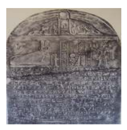
Pl.(9) Augustus before the Buchis bull Mond, R., the Bucheum (III), 1934, pl. XLIII.14