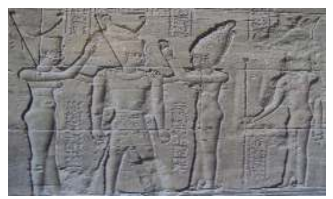
Pl. (19) Nekhbet and Wadjet are crowning Augustus before Isis, the lower register of the eastern exterior wall of the naos of Isis temple at Phila, Ibid, fig.105.