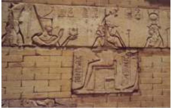
Pl. (12) Augustus is offering the religious symbols before Osiris and Isis- Kalabsha , Ibid, fig.15