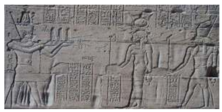
Pl. (18) Augustus is offering the Shyt before Isis and Horus, the lower register of the eastern exterior wall of the naos of Isis temple at Phila; Ibid, fig. 106.