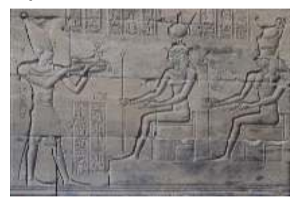
Pl. (17) Augustus is offering the Menit before Isis and Horus, the upper register of the eastern exterior wall of the naos of Isis temple at Phila; Ibid, fig. 108