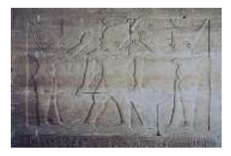
Pl.(15) Nekhbet and Wadjet are crowning Augustus- The lower register of the northern wall of the first room of the Naos- Kalabscha, Ibid, fig.174