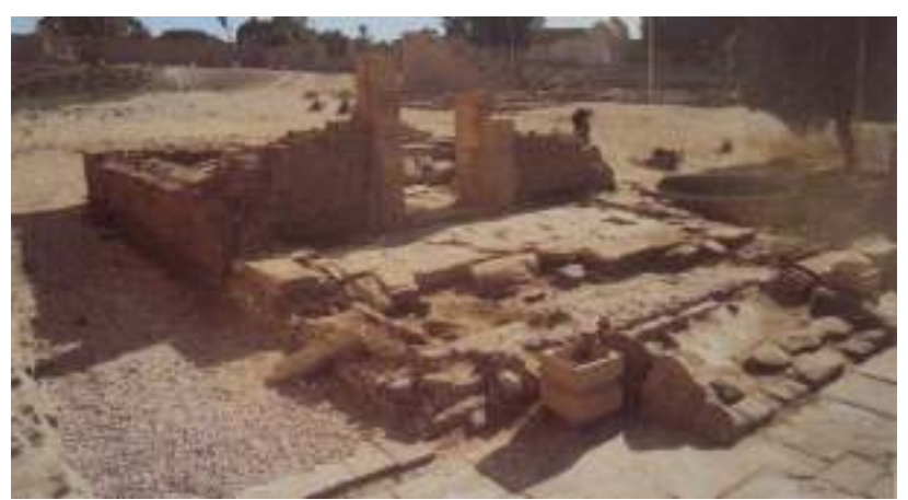
Pl. (3) Augustus's chapel at Karnak Ibid, fig.18