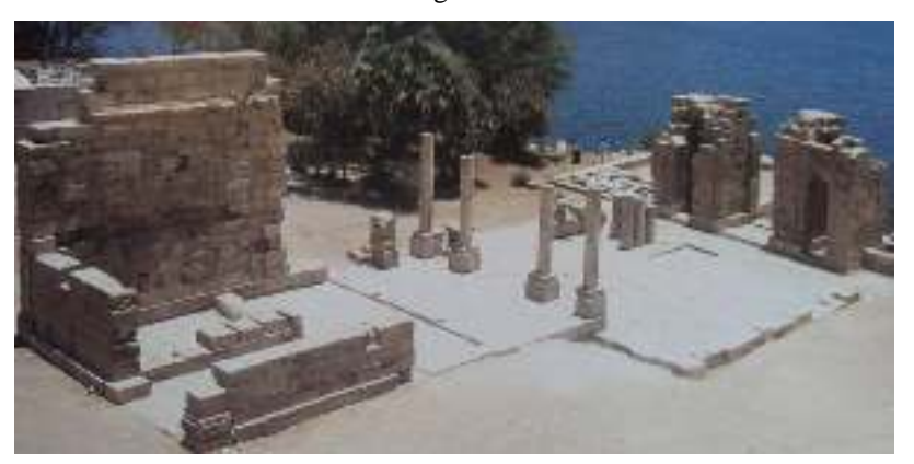
Pl. (2) Temple of Augustus at Phila. Hölbl, G., Altägypten im Römischen Reich, fig, 18.

Hölbl, G., Altägypten im Römischen Reich, Der römische Pharao und seine Tempel (I), Mainz am Rhein, 2000, fig.19.