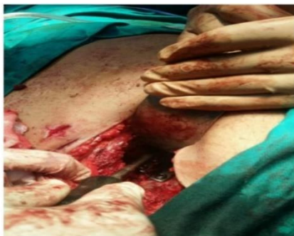
Figure [1]: Approach for anterior plating for sacroiliac joint disruption

iliac fossa and 4.0 mm fully threaded cancellous bone screws were used. Repair of the wound was achieved layer by layer, and a suction drain was left. Early walking was encouraged 2-3 days after operation with the usage of a wheelchair or crutches, when the pain was tolerated. Matta and Saucedo grading system was used for postoperative radiographic evaluation. The grades were: anatomic, nearly anatomic, moderate and poor. On the other side, the sacroiliac screw location was grades as adequate or inadequate. Overall radiologic outcomes were assessed by union time and quality of reduction. Radiological measures of the residual displacement of the pelvic ring was calculated from the difference in the height of femoral head from a line perpendicular to the long axis of the sacrum.