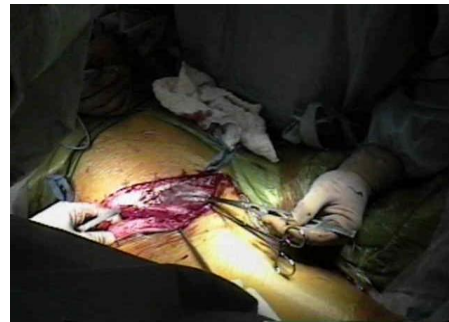
Figure [2]: Ilioinguinal approach for sacroiliac joint