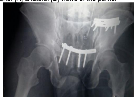
Figure [7]: show AP views after 3 month of fixation.