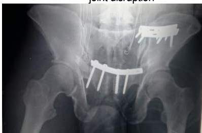
Figure [3]: The prebent plate was applied on the disrupted anterior ring