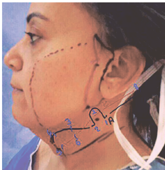
Fig. (4): Modified suture suspension technique, point 1 is below the angle of mandible acting as anchoring point that transfer the pull from horizontal to vertical vector. It is taken as a loop and not tied. Points 2-4 represents horizontal mattress suture. Points 4-5 is a vertical mattress suture at the anterior border of platysma. Points 5-6 represents the horizontal mattress returning back suture. The suture passes through the loop between points 1 and 2. Then, the suture changes from horizontal to vertical direction and secured to the center of the mastoid fascia including periosteum.