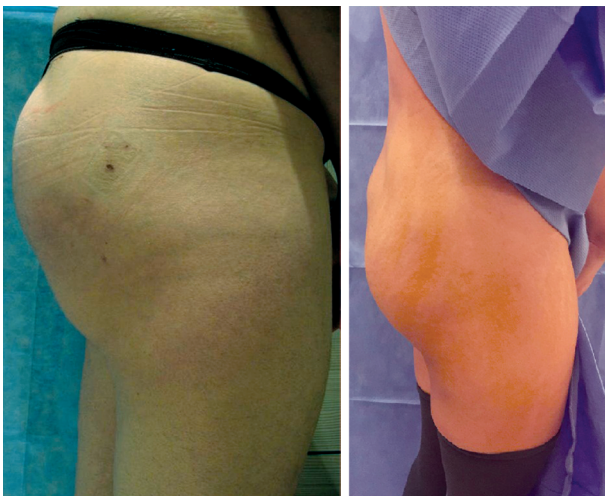
Fig. (2): Pre-operative (Right panel) and postoperative (Left panel) images of the buttock region of a sample patient as seen from lateral view. Post-operative image is taken at month 6 post-operatively.