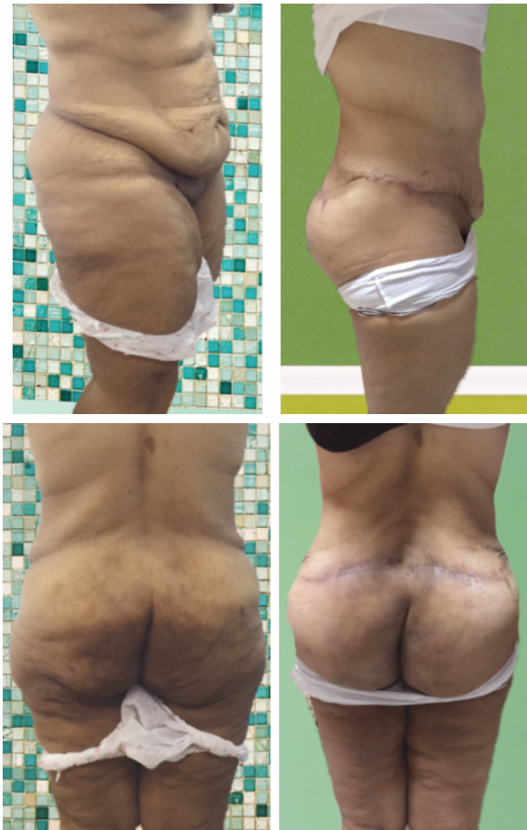
Fig. (3): (Upper) lateral view (Lower) front view pre-operative and post-operative (after 6 months) for a patient in Group B.

All patients had been followed-up for one year with no major complications (i.e., hematoma, thromboembolism, bleeding and skin necrosis). The aesthetic results were considered satisfactory in all cases with variable scores, of all 26 patients, 8 cases experienced at least one complication.