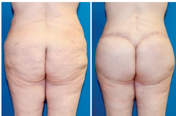
Fig. (2): Pre-and post-operative (after 6 months) for a patient in Group A.

Twenty-six post-bariatric surgery female patients, age from (23-44 years) underwent belt lipectomy/abdominoplasty after massive weight loss; There was a decrease in the distance between the iliac crest and perceived superior gluteal margin, a decrease in the distance between the L5 dimple and the central crease, with lifting of the central crease, and a relative increase in the buttock projection compared with pre-operative distance in both groups Figs. (2,3). All measurements were taken and statistically analyzed. The p -value was calculated for both groups and was found that there is a highly significant statistical difference in the post-operative measurements in Group A.