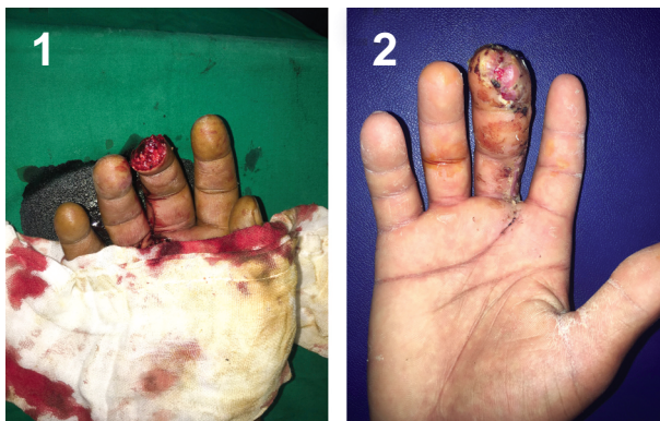
Fig. (3): The retro-grade homodigital flap. Case (3): Male patient aged 18 years old presented with Allen type II fingertip injury to the right middle finger. (1) Pre-operative volar view of the injury (2) 2 weeks post-operative after healing occurred and sutures removed.