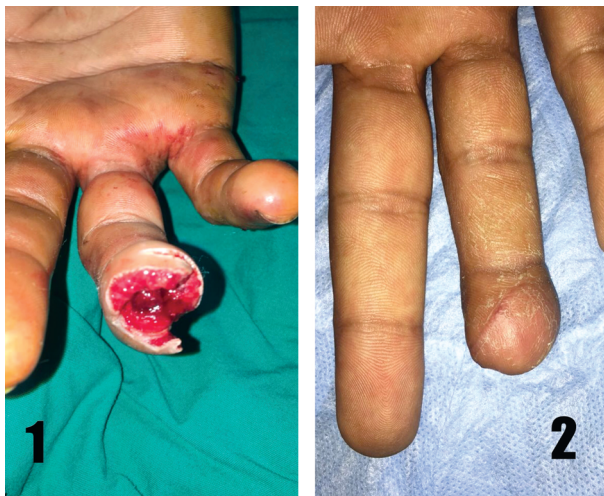
Fig. (1): V-Y advancement flap. Case (1): Male patient aged 27 years old with Allen type II injury at the left ring finger was treated surgically with Atasoy V-Y advancement flap. (1) Pre-operative picture. (2) 2 weeks post-operative showing sound healing of the flap.

Group II (conservative treatment): Adequate wound debridement under local analgesia, followed by treating the wound with either Platelet gel (10 cases) Fig. (6), Hyaluronic acid cream (10 cases) Fig. (7) or fucidic acid (10 cases) Fig. (8). Dressing change was done every 5 days till healing occurs within 2-4 weeks, then followed by motion exercises. The patient was seen for follow-up once weekly for the first two month then monthly for one year. All patients will be evaluated for wound complications (e.g. hematoma, infection, flap dehiscence), time of healing, time off work, functional outcome (including the sensory function which is measured using the two-point discrimination test, range of motion using Goniometer to evaluate the range of motion of the distal phalanx and cold intolerance in which each patient was asked if exposure to cold air or cold water or holding cold objects provokes pain, discomfort, or onset of other cold-related symptoms in the affected finger after healing has occurred), aesthetic outcome and patients' subjective satisfaction.