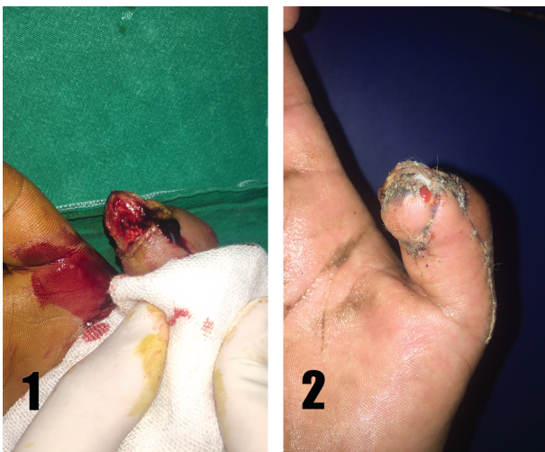
Fig. (5): Moberg flap. Case (5): Male patient aged 33 years old presented with Allen type II fingertip injury to the right thumb. (1) Pre-operative picture of the injury. (2) 2 weeks post-operative after complete healing.