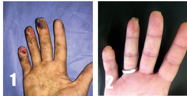
Fig. (6): Case (6): Male patient aged 37 years old presented with Allen type II fingertip injury to the right hand ring and little fingers. (1) Pre-treatment picture of the injury. (2) 3 weeks after the start of the treatment showing complete healing.