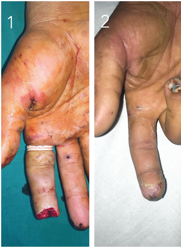
Fig. (4): Bilateral V-Y (Kutler) advancement flap. Case (4): Male patient aged 38 years old with Allen type II fingertip injury to the right index. (1) Pre-operative volar view of the injury. (2) 2 weeks post-operative picture with complete sound healing and sutures removed.