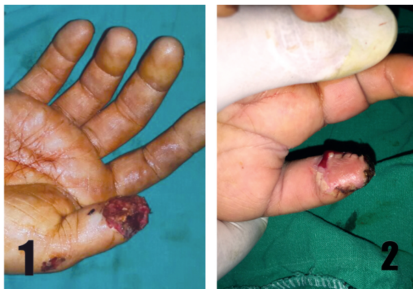
Fig. (2): Cross finger flap. Case (2): Male patient aged 20 years old presented with Allen type III fingertip injury to the right thumb. (1) Pre-operative picture of the injury. (2) 3 weeks post-operative picture showing complete healing.