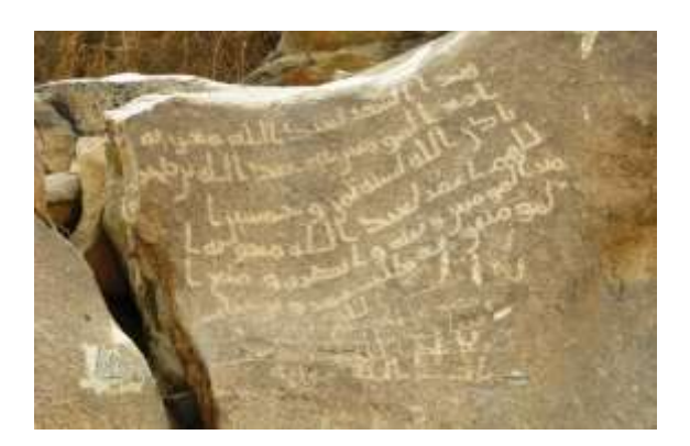
( Fig.8 ) Inscription Taif 58 AH / 678 AD