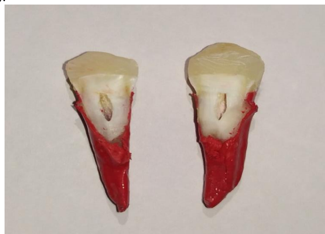
Figure (4): A photograph showing sample after sectioning.

Teeth were sectioned longitudinally in MD direction through the middle of the restoration using a diamond disc at low speed with water coolants. Fig (4).