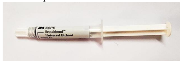
Figure (2): 3M ESPE scotchbond etching gel

Phosphoric acid etching gel 37% (3M ESPE scotchbond etching gel) was applied for 15 sec to the prepared tooth structure (enamel) as recommended by manufacturer's instructions (Fig 2), then rinsed thoroughly with water for 10 sec. and gently dried; without over dryness in a way that moist condition of the dentin was preserved.