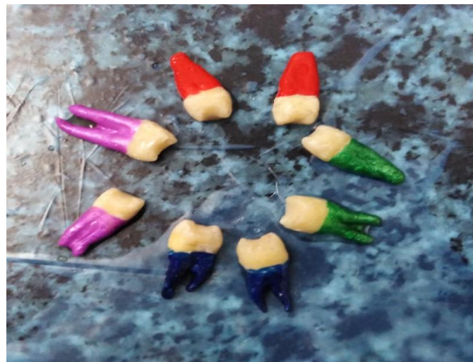
Figure (3): Sealing of the tooth apex with nail varnish

After demounting the teeth from the resin blocks, the restored teeth then dried thoroughly. The teeth were coated with two layers of an acid- resistant protective nail varnish except for an area approximately 1 mm around the margin of the restorations. The nail varnish was allowed to dry for 4 hours, to prevent silver penetration throughout the apical foramen, Fig (3).