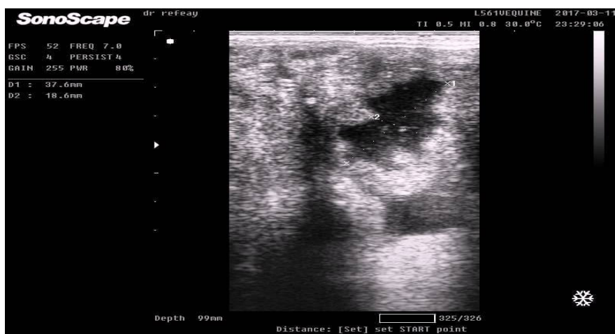
Image 2: Ultrasound image of mare uterus showing endometritis which appears as anechoic uterine lumen measured 18.6 mm- 37.6 mm with some echogenic particles.