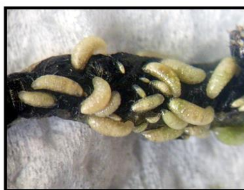
large size host