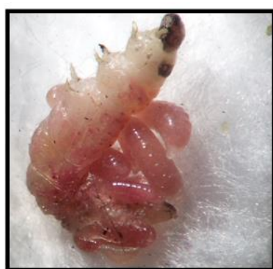
small size host