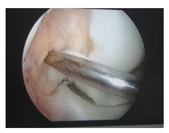
Figure (1): femoral tunnel preparation

After clinical and arthroscopic examinations under anesthesia, the hamstring tendons graft were sacrificed and the anterolateral and anteromedial portals were created. To set the ACL graft in the anatomical femoral foot print, an accessory medial portal might be needed to drill the femoral tunnel to the lateral cortex by 4.5 mm reamer then by 7 to 9 mm reamer to a depth of 30 mm according to the graft diameter. Using the ACL tibial C-guide with a 55°, the tibial tunnel was drilled and the ACL graft was passed through the tunnel. The femoral side of the graft was fixed by fixed or adjustable loop (with knot tying) as selected randomly and the tibial side of graft was secured with a bioabsorbable interference screw. (Figures 1, 2)