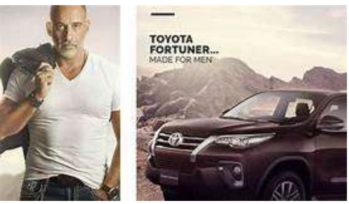
Figure (7): Men in recent ad portrayal

Stankiewicz & Rosselli, (2011) asserted that Exposure to sexually objectifying advertisements of women produces "anti-women attitudes" and negative stereotypes. For example, the belief that females are only precious as tools for the aspirations of males, that a true man has to be sexually violent, that cruelty is "erotic", and that females who are victims of a sexual attack "asked for it". Females' portrayal as sex tools and presenting them as victims of violence emphasizes the belief that obedience and surrender are inherent attributes in females.