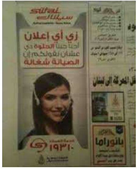
Figure (8): Women as sex tools shown in the text

Stankiewicz & Rosselli, (2011) asserted that Exposure to sexually objectifying advertisements of women produces "anti-women attitudes" and negative stereotypes. For example, the belief that females are only precious as tools for the aspirations of males, that a true man has to be sexually violent, that cruelty is "erotic", and that females who are victims of a sexual attack "asked for it". Females' portrayal as sex tools and presenting them as victims of violence emphasizes the belief that obedience and surrender are inherent attributes in females.