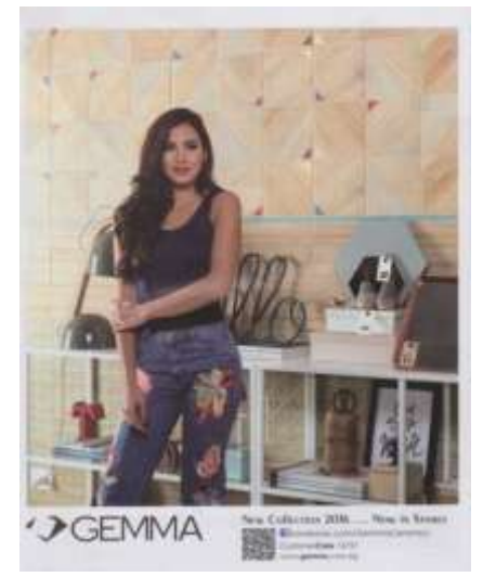
Figure (9): Women as sex tools shown as decorative objects