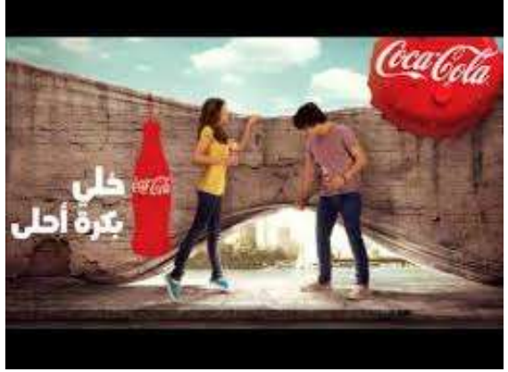
Figure (2) women and men are represented equally

Recent years especially after the 25<sup>th</sup> of January revolution, gender representation has shown significant change in the stereotype of portrayal of women particularly in digital advertising. The revolution has contributed to a social and cultural shift in the role of gender and its stereotypical presentation in social media as a digital platform of digital advertising. The availability of the technology and the great contribution of Egyptian women in the up rise, led to an evolutionary representation of gender stereotype.