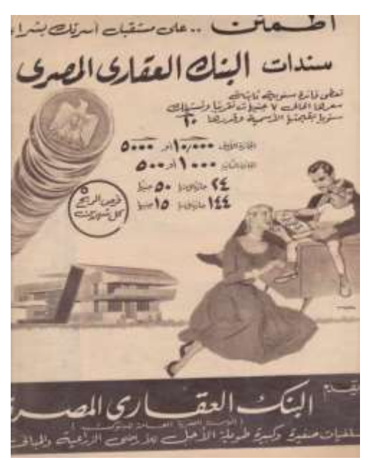
Figure (1) women are represented as in a less status than men

Recent years especially after the 25<sup>th</sup> of January revolution, gender representation has shown significant change in the stereotype of portrayal of women particularly in digital advertising. The revolution has contributed to a social and cultural shift in the role of gender and its stereotypical presentation in social media as a digital platform of digital advertising. The availability of the technology and the great contribution of Egyptian women in the up rise, led to an evolutionary representation of gender stereotype.