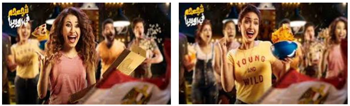
Figure (5): Women in recent sport ad

Contemporary advertising in Egypt represents women as a strong partner in sports events either as spectator or as a player. It is common in recent ads to see Egyptian women in a sportive occupation, unlike past ads that portrayed men as the dominant gender in sports occupations.