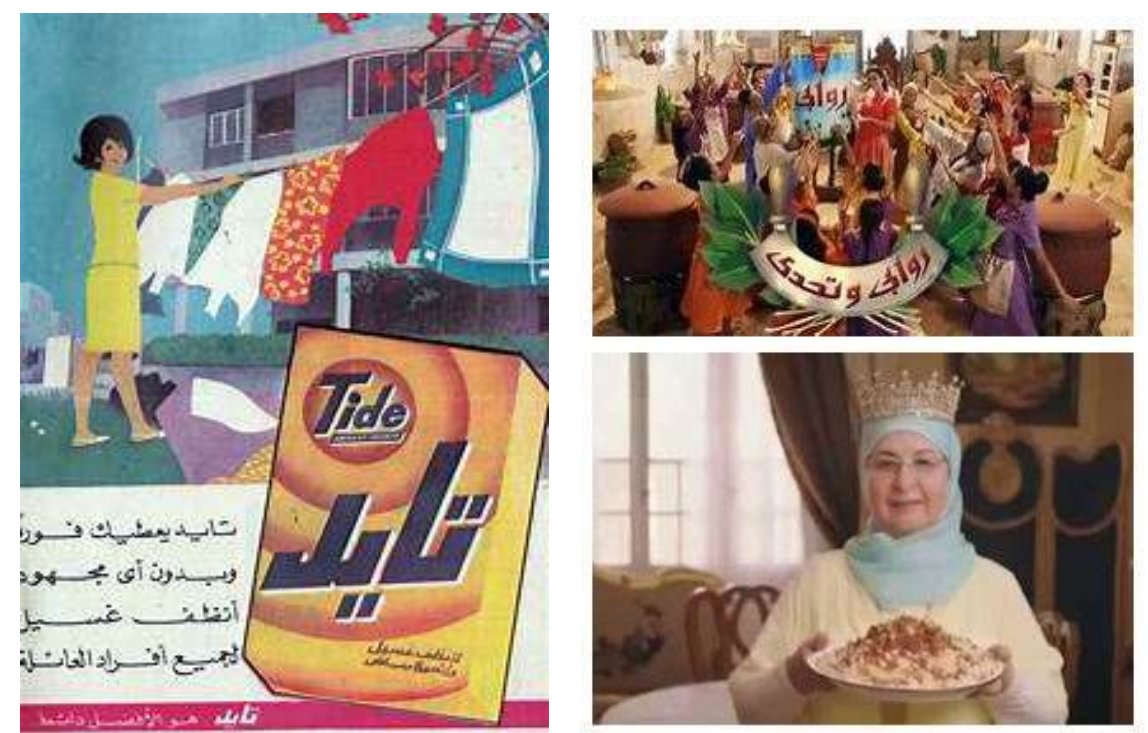
Figure (3): Women as housewives in a domestic context

According to Tarek Nour (2017), one of the pioneers in the field of advertising in Egypt, these portrayals are derived from our Egyptian culture. It is embedded in our traditions that women always exist domestically as housewives while the man is the one who works. See figure (3) in which ads from past times represent women in a domestic context as housewives who strive to please the mother in law and who are rewarded for being a good housewife.