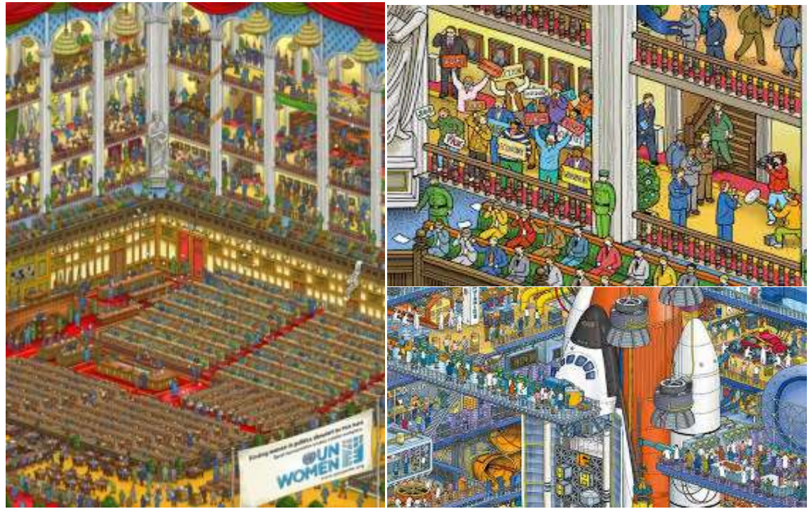
Figure (12): Can you spot the woman in this illustration? (IC4Design:2017) (DDB Dubai)

a parliamentary building and a scientific research facility. The ads are a challenge to spot the only woman in each sector, and every ad carries the campaign's message, "Finding women in technology/politics/science shouldn't be this hard. Let's work together for equal representation in the workplace." Cairo Today (2017).