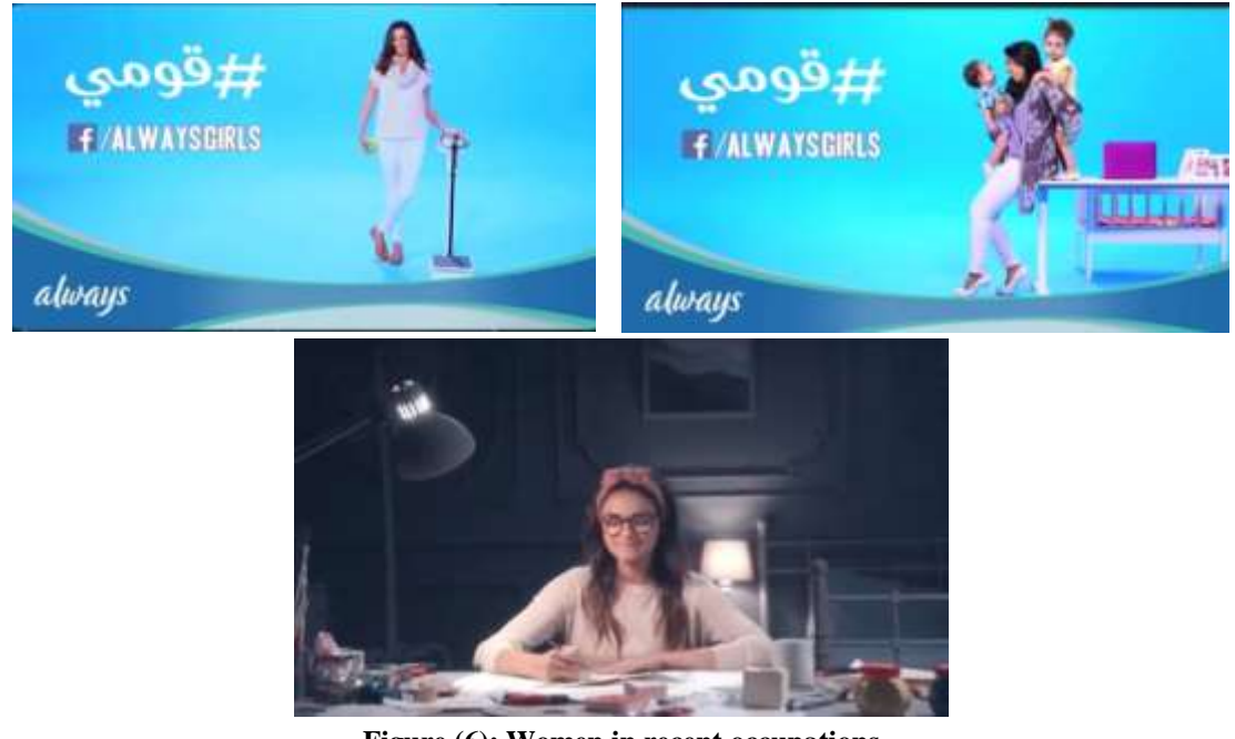
Figure (6): Women in recent occupations

Women occupational status is one of the prominent elements of stereotyping in advertising. (Eisend, M. 2010). Occupational status is an important category, as the most significant changes in gender equality development can be observed in this area, and gender equality in this area is a major concern of gender-related policy. Recent ads portrayed women as successful professional, human beings, Writers, businesswomen, physicians, entrepreneurs, among other professions that Egyptian women are portrayed occupying them. See figure (6)