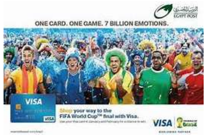
Figure (4): Men dominance in sport ad

For a long time, discouragement of women's accomplishments especially in sports dominated the advertising scene. That is, advertisements in Egypt emphasize the notion that a number of sports, such as soccer, are only 'male-dominated'. For this reason, the majority of advertisements that utilize eminent soccer or athletic players are performed by male athletes, not females. See figure (4).