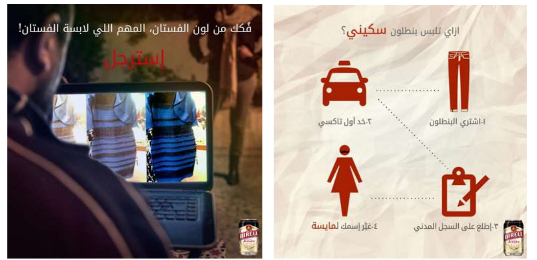
Figure (10) Birell Ad Man Up (be a man) 2009

One of the advertising campaigns that have been criticized for promoting sexism and gender discrimination concerns is Birell's 'skinny jeans campaign' 2009. The ad states that if you are to wear skinny jeans, you are not a man the ad appears to promote cat-calling, staring and maybe more. The latest campaigns have even attracted the anger of social media users who have accused Birell of sexism and the promotion of sexual harassment. "It is sexist. It is offensive, and more than anything, it is socially irresponsible. As a company with its popularity, promotion of social issues is not only a duty but an obligation." Khairat, M. 2015