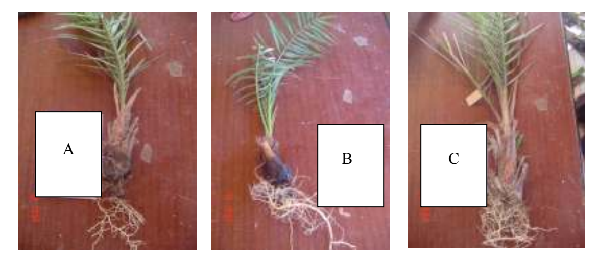
Plat 2. Effects of metal nanoparticles and NAA on mean root length of ground offshoots (A) Amry cv. (B) Khudary cv. (C) Hayany cv.

main roots) than when compared with the control, followed by 0.5% NPs-ZnSO<sub>4</sub> + 8% NAA treatment in both seasons. As for the specific effect of different cultivars, results in Table 2 show that Hayany cultivar produced the longest main root length (small and large) compared with other cultivars in both experimental seasons. Regarding, the interaction effect between nanoparticles practices and cultivars on longest main root length, results in Table 2 indicate that Hayany cultivar treating the ground offshoot's bases with 0.5% NPs-FeSO<sub>4</sub> + 8% NAA produced the longest root length compared with the other treatments. The untreated Khudary ground offshoot's treatment showed a significant reduction in the longest main root length (small roots), while the untreated Amry ground offshoot's treatment gave the least value of the longest main root length (large roots) in both seasons. These results are in line with those obtained by El-Hammady et al. (1992), Lavee et al. (1994) and Al-Obeed (2005) who concluded that, a positive effect of the NAA treatment on Khalas, Succary and Seleg offshoots for rooting length. Al-Mana et al. (1996) reported that the highest rooting in aerial offshoots of Shish cultivar was achieved with 8% NAA treatment followed by those treated with 8% NAA+50 ppm catechol.