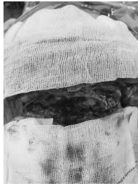
Fig. (1): Intraoperative photograph of bilateral subfrontal approach to remove OGM.