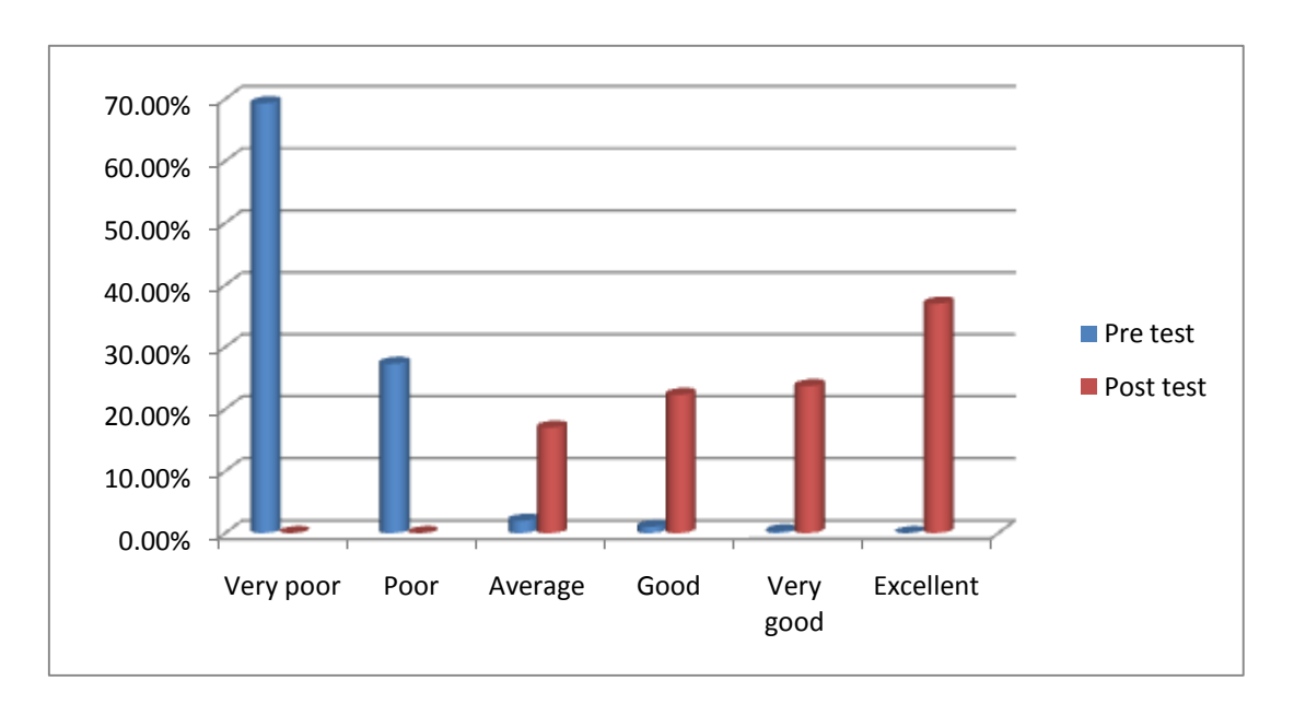
Figure (1): Comparison between percentage of participants' knowledge score before and three months after application of BLS educational program