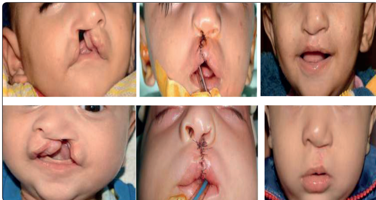
Fig. (2): Photographs showing patients in preoperative, immediate postoperative and six months postoperative views.