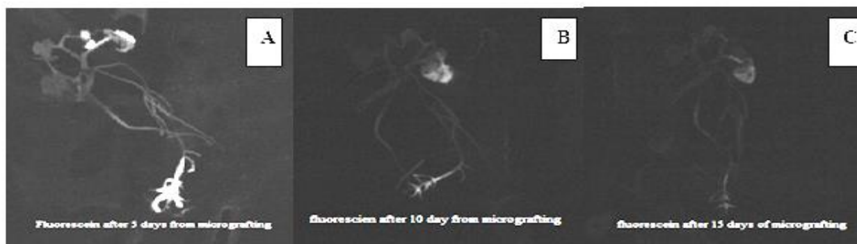
Fig. 2. UV scan for fluorescein stain transfer in the grape vessels after 5, 10 and 15 days of micro-grafting process.

According to the Fig. (1-c) using alginate gel in micro-grafting connected the scion to the rootstock, fluorescein stain used to detect the cell sap transfer from the rootstock to scion. After five days of micro-grafting, scion leaves were isolated and investigated under UV device to scan fluorescein stain Fig. (2-a). After 10 days the stain still present but light concentration (Fig. 2-b) and decreased after 15 days Fig. (2-c).