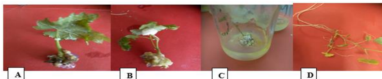
Fig. 3. Rhizogenic callus included scion and culture on media containing stain after micrografting (a and b) and after two weeks (c), alginate matrix after two weeks (d)

formed by large cells with large inter-cellular spaces. Some cells cytoplasm was dense. At this stage, the established cambial relation between graft elements was very clear. New xylem and phloem elements were few in number and they started to differentiate (Figure 3).