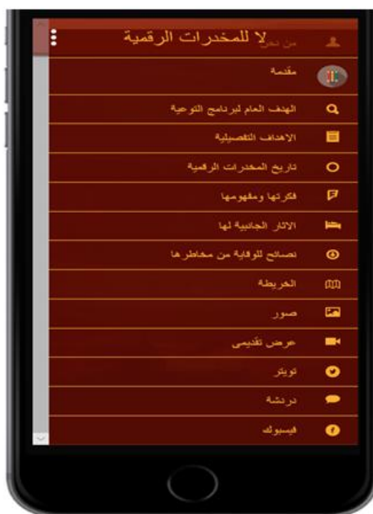
Fig.2 The main screen of final versions of digital drugs apps

the teacher in the classroom according to the time limit of computer science subject. Also, the experiment groups used training demonstrations about the way of using mobile technologies application to explore the learning resource materials and demands support via social media tools available in the proposal app (for exp. WhatsApp, Facebook). The author produced learning materials included tips and guidelines for describe the way to protect teens from side effects when dealing with