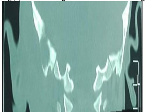
Fig(3). CT temporal coronal cuts show soft tissue density in the mastoid and destruction of lateral mastoid cortex & tegmen antri with subcutaneous abscess.

Fig(2). Haematological evaluation for diagnosis of Kostmann syndrome.