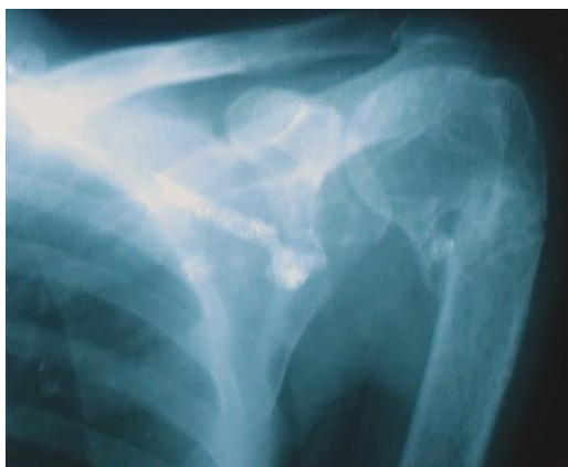
Fig 3. Malunion case after 5 months follow up.

Pain analysis disclosed eight cases (27%) suffered from moderate pain while thirteen cases (43%) showed mild pain and nine cases (30%) had no pain.