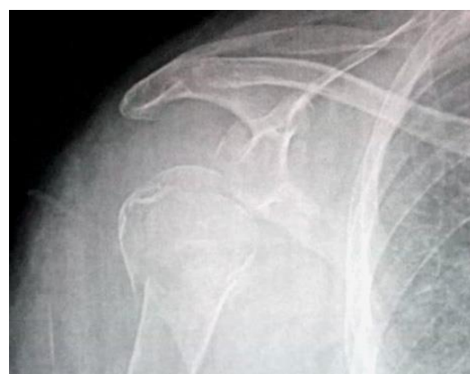
Fig4. Inferior subluxation of the humeral head.

As regards the presence of other complications ( Fig 2 ), there were four cases (13%) of malunion ( Fig 3 ), three cases (10%) of avascular necrosis of the humeral head, four cases (13%) of inferior subluxation of the humeral head ( Fig 4 ) and two cases(7%) of posttraumatic arthritis.