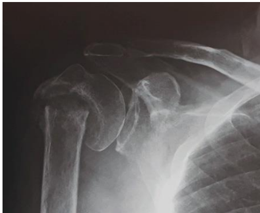
Fig 1. The nonunion case at 6 months follow-up with resorption of the surgical neck.

Nine cases (33%) showed nonunion(Fig 1) after 6 months while eleven cases (37%) show delayed union after 3 months.