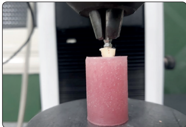
Fig. (1): Fracture resistance test setup.