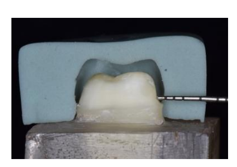
Figure 1. Teeth preparation.

A stereomicroscope Leica S8 APO at magnification 32X used to determine the vertical marginal gap (figure 3) . A previously marked 5 points on each aspect of each crown are measured (with total 20 points). These measurements were taken before and after thermo-mechanical cycling.