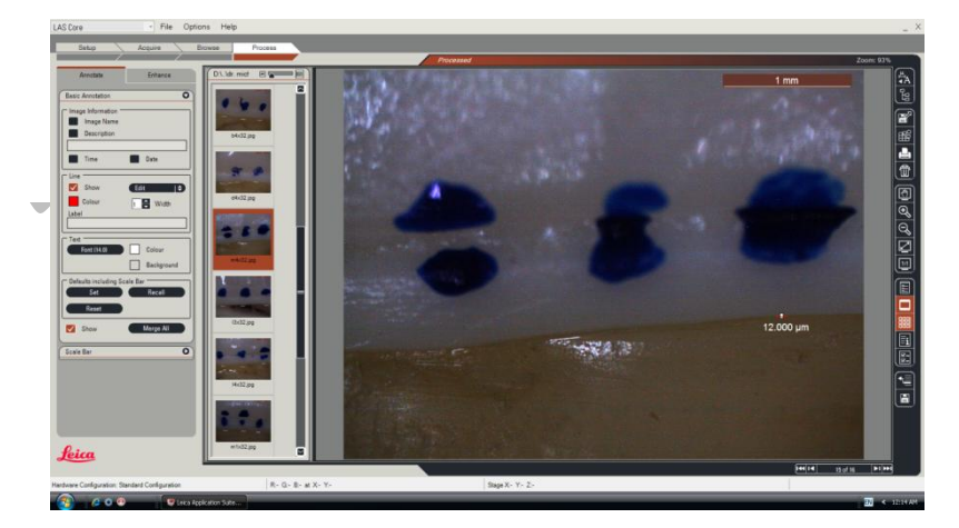
Figure 3. Leica Application suite (LAS) Version 4.0 software.