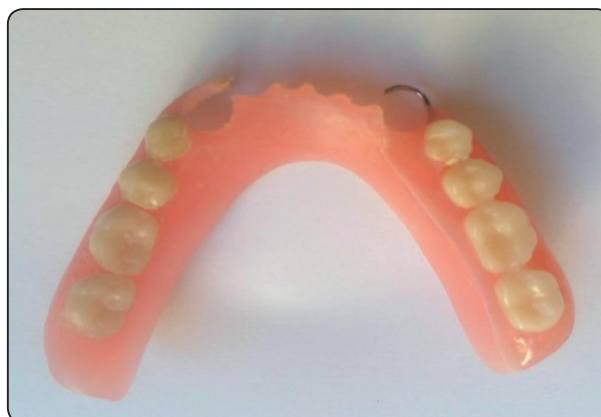
Fig (2) Finished acrylic removable partial denture with wrought wire clasp at the right side and polyamide clasp at the left side.

junction of the abutment. Reference contact points(d & b) were the highest points of the mesial and distal interdental alveolar bone of the abutment respectively. The change in the length of (cd) and (ab) perpendicular lines were measured to estimate the bone level change measially and distally; while (a & c) points located on (B and C) lines. (fig.3)