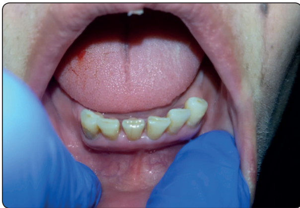
Fig. (1) Mandibular bilateral long edentulous spans posterior to the canines

This study was carried out on 14 participants with age group ranged between 55 - 68 years, (mean age 61.14 year; 9 males and 5 females). These participants were chosen according the following eligibilities: They were healthy with no systemic diseases achieved by physician, They had a good oral hygiene and upper completely edentulous arch against mandibular bilateral posterior edentulous span. (fig.1). Periodontal conditions of the remaining teeth were healthy and the crown-root ratio of the abutment was more than 1: 1.