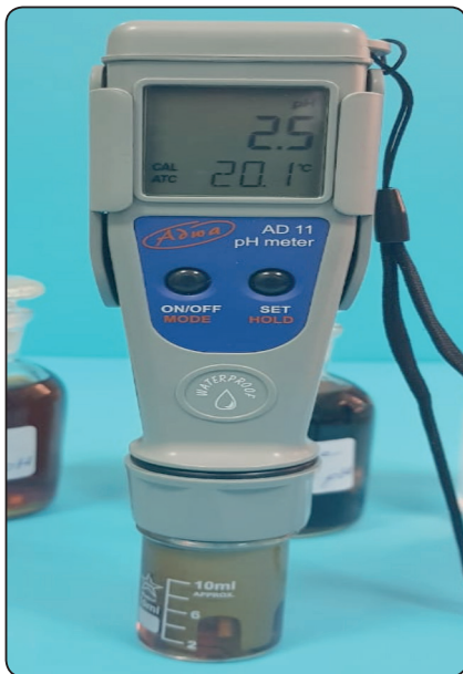
Fig. (2) Digital pH meter verifying pH of cola solution

The pH value of the different storage media was measured by a digital waterproof pH meter (Adwa AD 11, Romania) as shown in figure 2. Specimens were immersed individually in closed vials containing 5 ml of each medium and stored at 37 0 in an incubator (CBM.TORRE PICENARDI(CR), Model 431/V, Italy). The solutions were freshened daily to avoid yeast or bacterial contamination and stirred twice daily to reduce the precipitation of particles. By the end of the immersion period, specimens were rinsed with distilled water and wiped with gauze