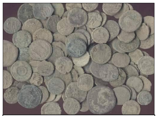
Figure (2) Coins with relatively good state of preservation, which can be displayed after preservation and restoration interventions.