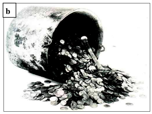
Figure (1) \underline{\mathbf{a}} monetary artefact removed from the Baltic Sea water, \underline{\mathbf{b}} money recovered from dried archaeological sites, where the pedological action was minimal