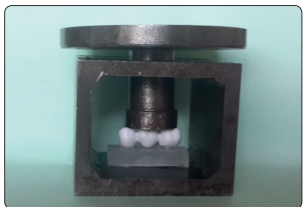
Fig. (2) Cementation of bridge under 3kgm Load.

All FPDs were stored in deionized water in an incubator (QWJ500, Queue Systems Inc. USA) so that samples were maintained at oral temperature at 37^{\circ}\text{C} . Samples were removed 24 hours before measurements were taken.