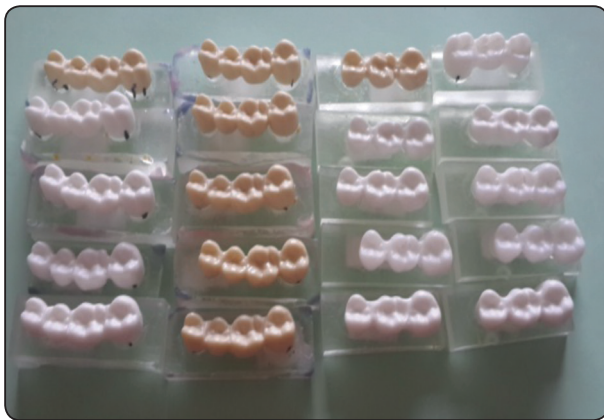
Fig. (1) Twenty monolithic FPD samples that were used in the study

Two stainless steel models (one for each group) representing prepared abutments were prepared using engineering lathe (Automatic feedback lathe- BV20B-L Bengu Dome Siticmaxhime tool, China). Abutments were prepared to be 5mm in height and have 1mm shoulder finish lines and was prepared with 12 degrees convergence angles. Prepared abutments were screwed to a stainless steel base while being spaced with a suitable pontic distance to represent a case of missing second premolar (group A) and another case of missing second premolar and first molar (group B). For each model 10 impressions were made using polyether impression material (Impergum Penta, 3M ESPE, USA). Impressions were poured using epoxy resin material (Table Top Epoxy Resin, clear crystal, USA). Each model was duplicated to a stone model which was scanned using Cercon Eye, then FPDs designing was done using Cercon Art. FPDs were constructed using CERCON machine then placed on their epoxy resin models (Fig. 1).