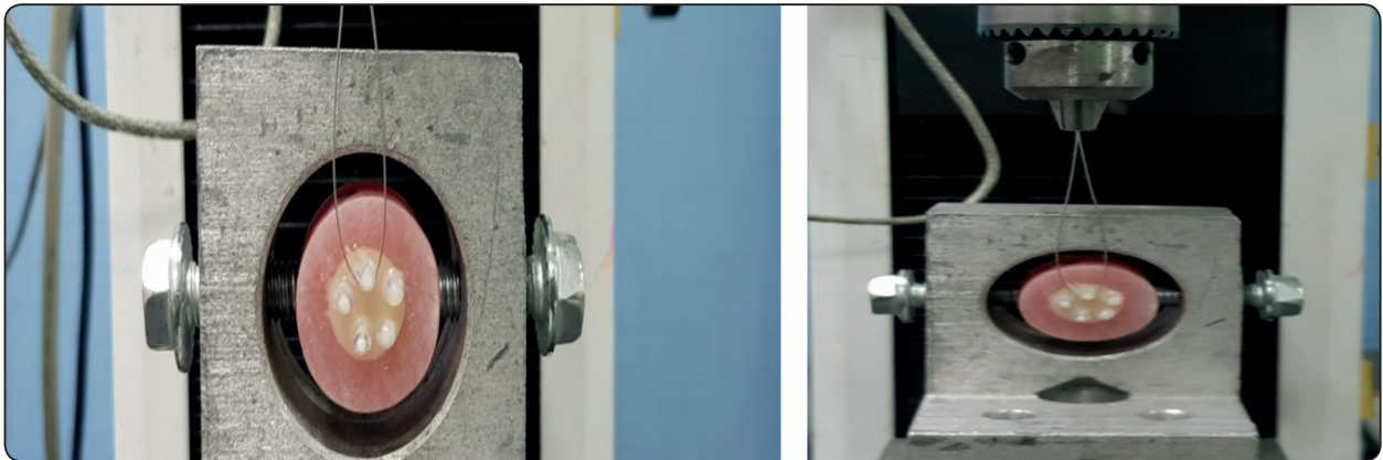
Fig. (1): A mounted disc secured horizontally with tightening screws to the lower fixed compartment of a materials testing Instron machine.

between the other subgroups within the same group (Groups II, III, IV and V). Monobond Etch & Prime surface treatment resulted in higher micro-shear bond strength compared with HF surface treated subgroups for all the tested materials except for the PM9 and IPS e.max CAD.