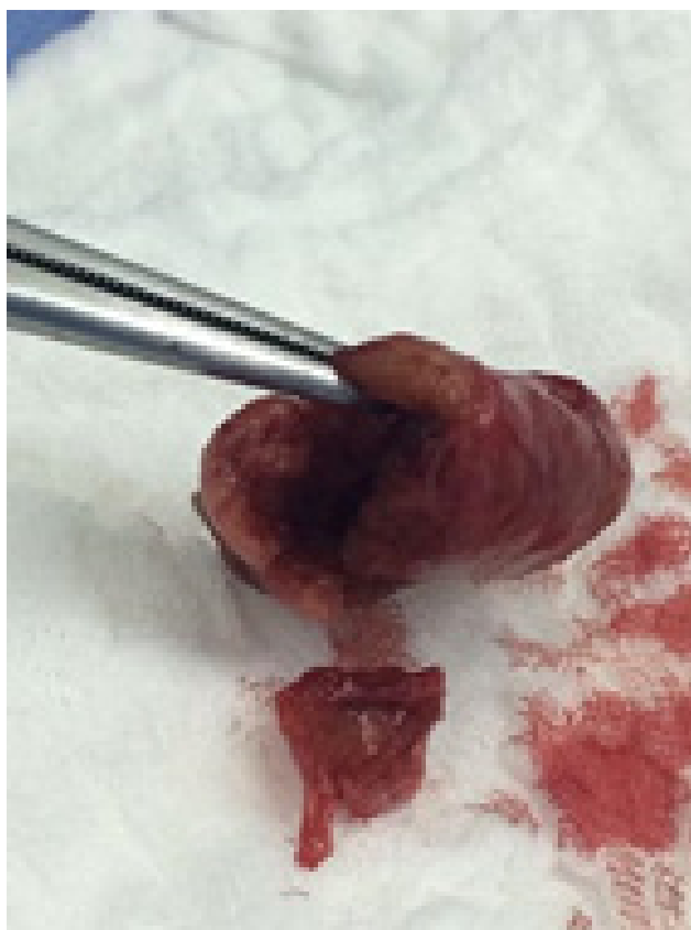
Fig. 2: The excised mass contains a blood with in its cavity and has a thick wall

The mass was easily excised completely under general anesthesia and sent for histopathological examination. Grossly the mass was an oval in shape, 5x3 cm in diameters, when we excised part of it, its cavity contains blood with a thick wall but it contains no hair (Figure 2).