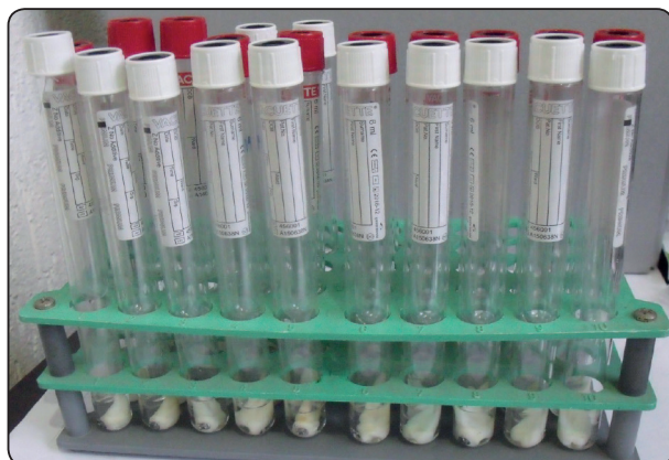
Fig. (2) Samples placed in standard demineralizing solution

Data were presented as mean and standard deviation (SD) of the degree of enamel demineralization. Kolmogorov-Smirnov tests were carried out to assess the normality distribution of continuous variables in different groups. Since these variables were not normally distributed, non-parametric tests were used for statistical comparisons.