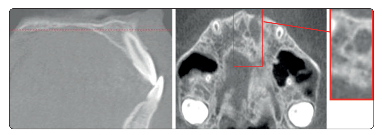
Fig. (1) (Left)Sagittal and (Right) axial sections at the level of 3 mm below ANS, showing mid-palatal suture