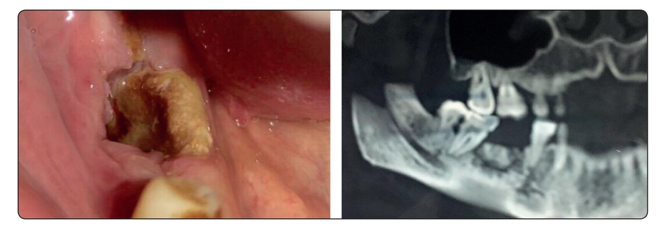
Fig. (1) (A) Preoperative photograph shows a lesion of MRONJ. (B) Preoperative radiograph shows a lesion of MRONJ.

Our surgical protocol was to remove all infected tissue of both necrotic sequestrum and granulation tissue first by using surgical curettes until enhancing fresh bleeding from bone, later by rotary instrument for osteoctomy and rounding any sharp bony edges, this was followed by intensive irrigation of broad spectrum-antibiotic solutions (2g of third-generation cephalosporin in 1L saline), aiming to minimize remaining bacterial contamination and remove of any debris or foreign bodies. Patients were randomly assigned into three groups according to intended material that would be placed on the bony defect. Group A were treated with L-PRF only, Group B were treated with rhBMP-2 on a collagen sponge carrier, while Group C were treated by both rhBMP-2 and PRP.