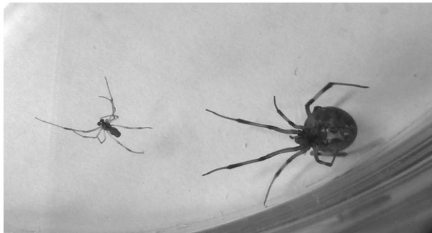
Fig. 2. Ventral view of male and female Latrodectus geometricus before mating.