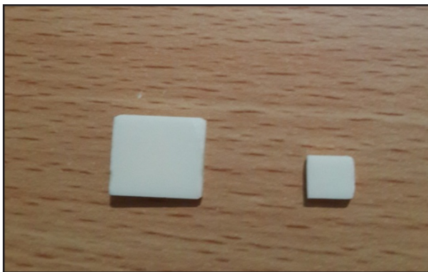
Fig. (1): Two zirconia samples with larg and small dimensions