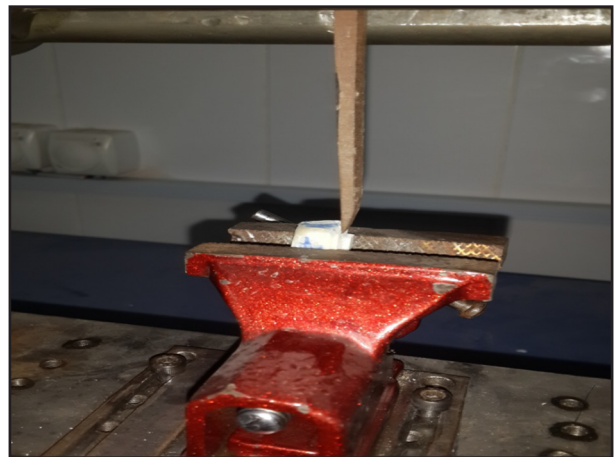
Fig. (3): Load applied at zirconia cement interface