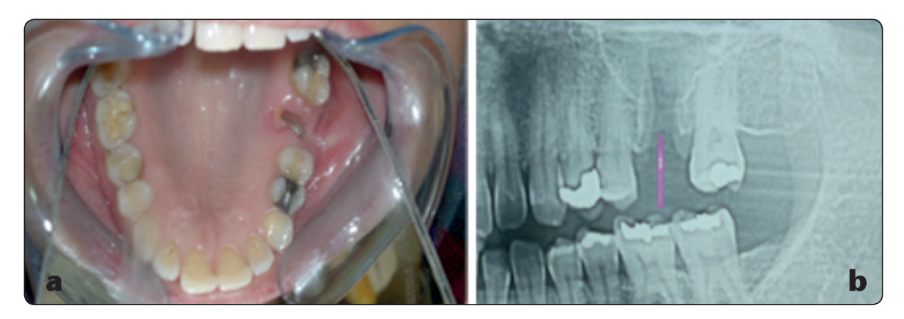
Fig. (1) a) OAF, b) Preoperative panoramic X-ray showing OAF (arrow).

All patients with sinusitis were prepared 3 to 5 days before surgical closure of OAF, with oral administration of Sultamicillin (Unictam, MUP, Egypt) 375 mg 3 times/day, or erythromycin (Erythromycin, Pharco, Egypt) 500 mg 3 times/day if the patient was allergic to penicillin, and maxillary sinus lavage by using 1 % povidone-iodine (Betadine, Nile/MundiPh, Egypt) through OAF.