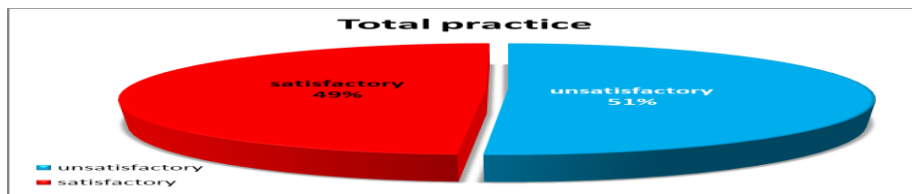
Figure(2): Total practice regarding orthopedic patients with external fixation among studied nurses (n=55).

Figure (2): show that 51% of studied nurses had unsatisfactory total practice regarding orthopedic patients with external fixation