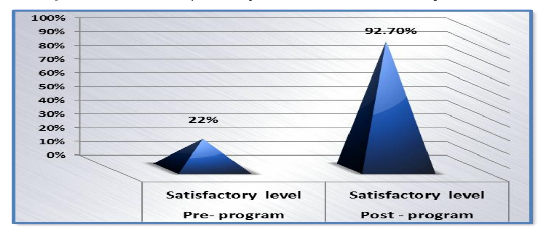
Figure (1): Distribution of mothers according to their total satisfactory knowledge about the sexual harassment as phenomena. (n = 110).

Figure (1): Total satisfactory knowledge about the sexual harassment as phenomena.