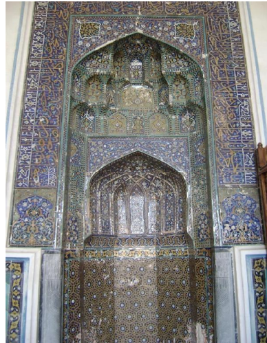
Figure (3) the carver's name on a mosaic band of the mihrab.

inscribed on the mosaic band of the mihrab of the Kalyan mosque, fig. (3). Thus this is the same name. And we can conclude that the mihrab was built in 948H./ 1541.