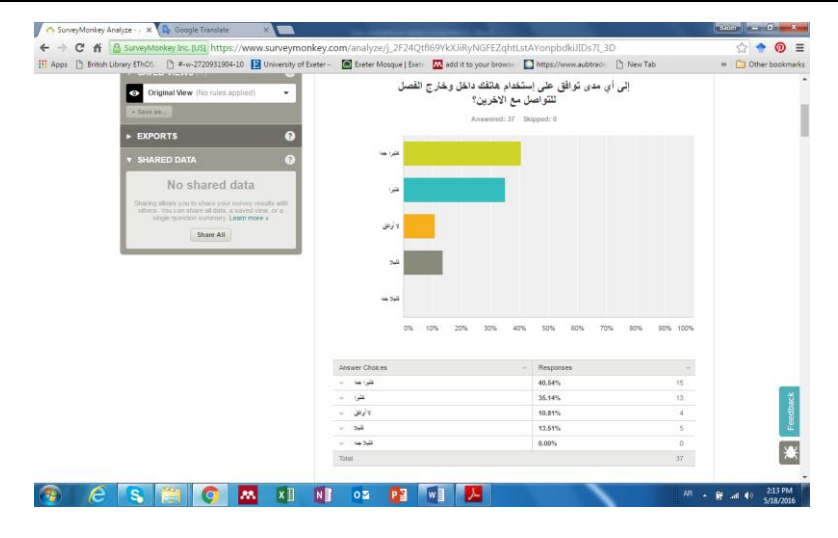
Figure 4: Example of responses from participants