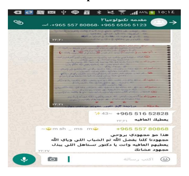
Figure 5: Example of communication between the participants via WhatsApp

reporting absences. In addition, WhatsApp was a channel through which the students asked their peers and teacher for help and support. Moreover, it was found to be a useful app for all concerned, in terms of its capacity to capture and exchange images conveying important information, without the need to write about it. For example, images of technical challenges were exchanged, such as not being able to access a website or the free online quiz maker on classmarker.com – which was required for the summative activity. The following Figure (Figure 5) is an example of communication between the students in Group 2, where one member summarises what was studied earlier and his peers thank him.