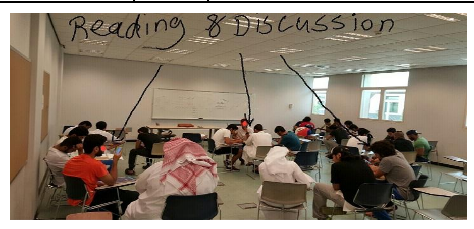
Figure 2: Participants reading relevant topics from their own smartphones, engaging in discussion with fellow group members and presenting collective and summative reports

It was observed that with 45 or more participants all using their smartphones at the same time, the classroom management initially deteriorated, with chaos and noise. Within around 10 minutes, however, the noise level had dropped and there was more focus on the lesson objective, i.e. to read about DL. It would seem that once the researcher explained that the session would entail an open discussion as preparation for the next lesson, the students were relieved and appeared to be more comfortable. The researcher also noted a few participants who had failed to bring the course book or their own smartphones, e.g. because they had left them at home, in their cars, or else their subscriptions had expired.