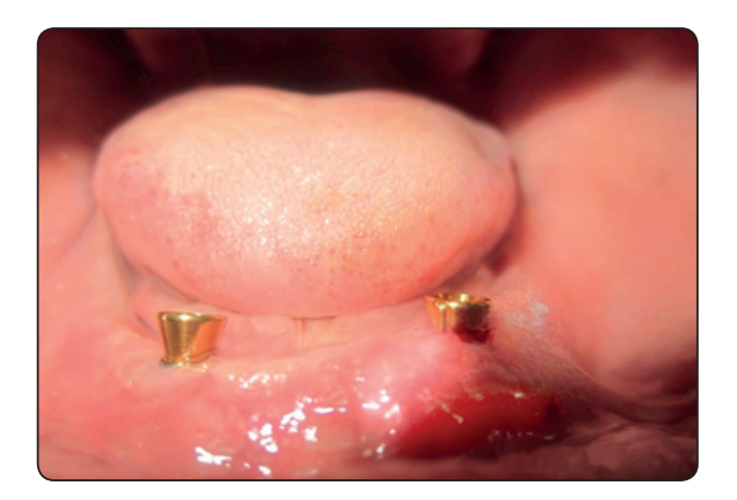
Fig. (1) Magnetic attachments inside patients mouth

Group C: Patients in this group received implant retained overdenture with locator attachments and direct pick up was performed directly in the patient's mouth.