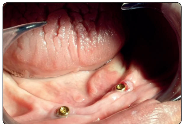
Fig. (2) The locator abutments in their position in the patient's mouth