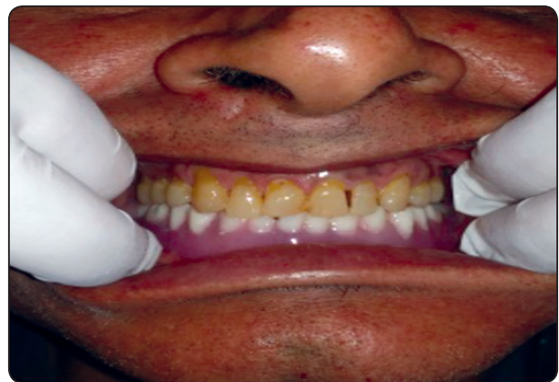
Fig. (3) The relined denture in the patient's mouth