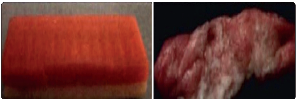
Fig. (4) chewing gum