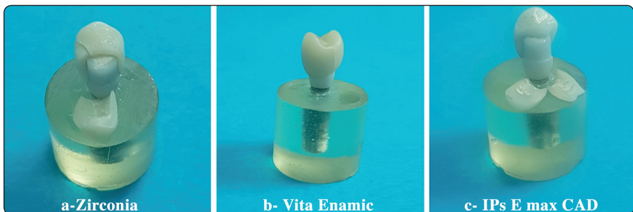
Fig. (2) Representative samples of fractured all-ceramic crowns cemented on ready made abutments

IPs E max CAD crowns showed catastrophic fracture of the crowns, the fracture line located occlusally at the central developmental groove and extended mesiodistally till the finish line area. Furthermore, another mid palatal longitudinal fracture line was manifested splitting the functional palatal cusp and the short palatal surface into two fragments. Similar to zirconia crowns, the longer buccal half remained attached to the abutments. (Figure 2, c)